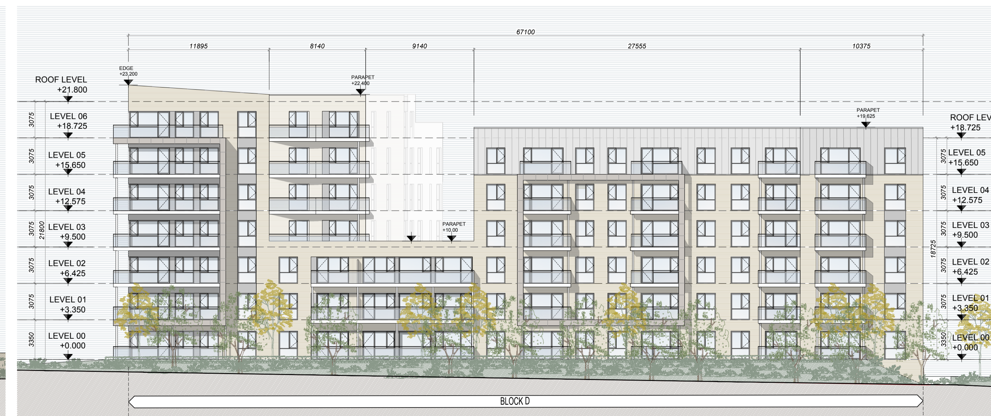
BLOCK D - EAST ELEVATION - 04