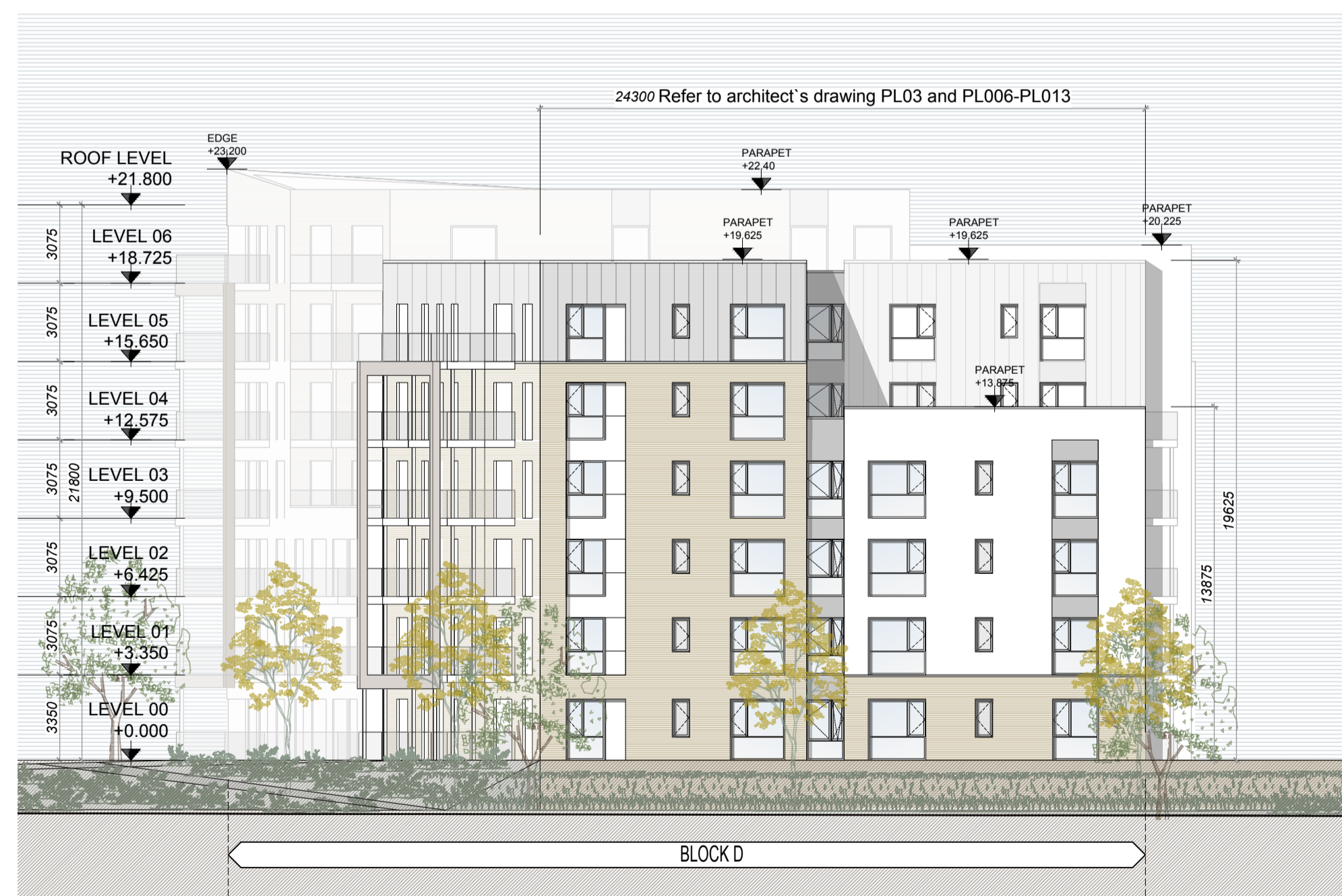
BLOCK D - NORTH ELEVATION - 02