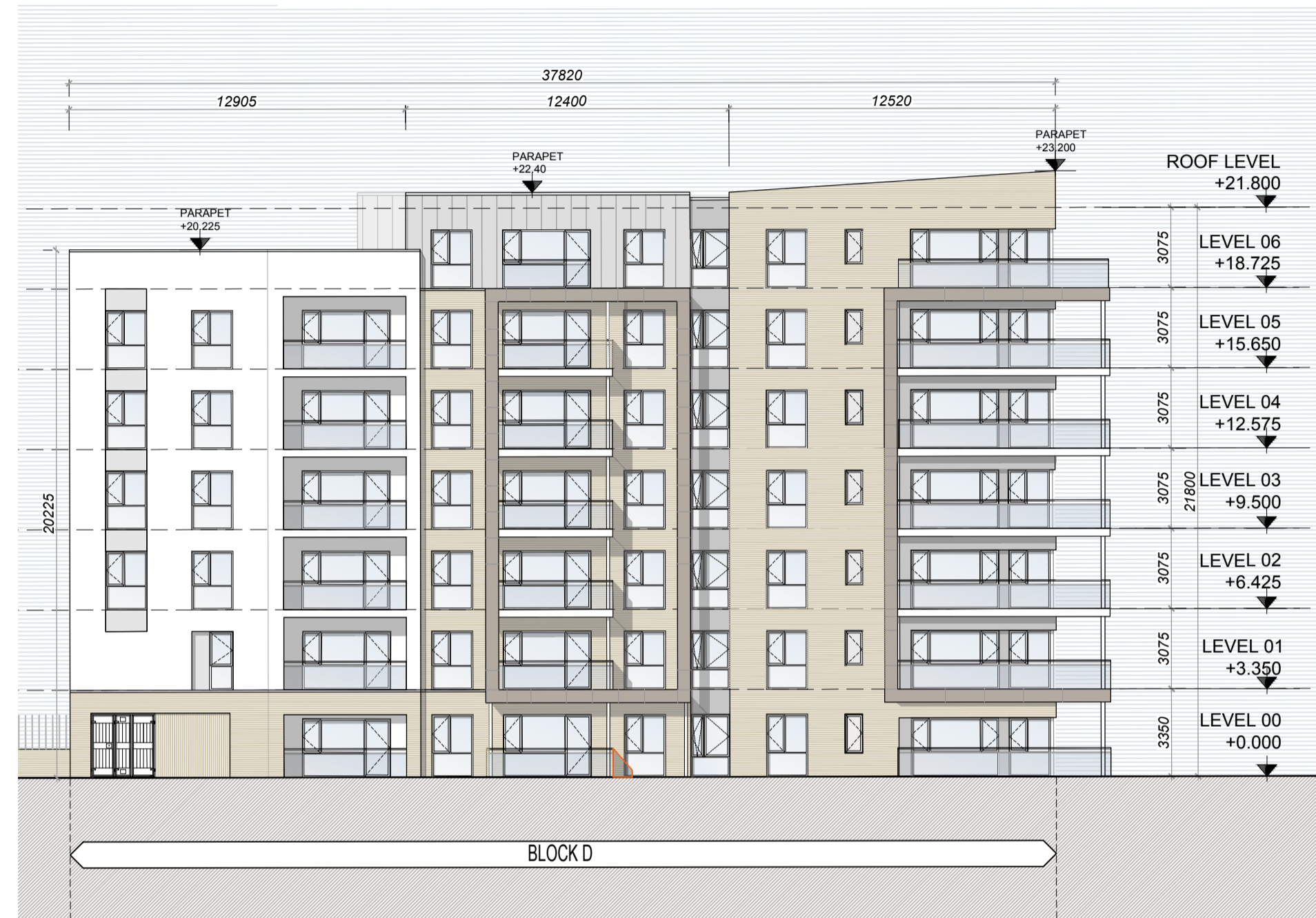
BLOCK D - SOUTH ELEVATION - 01